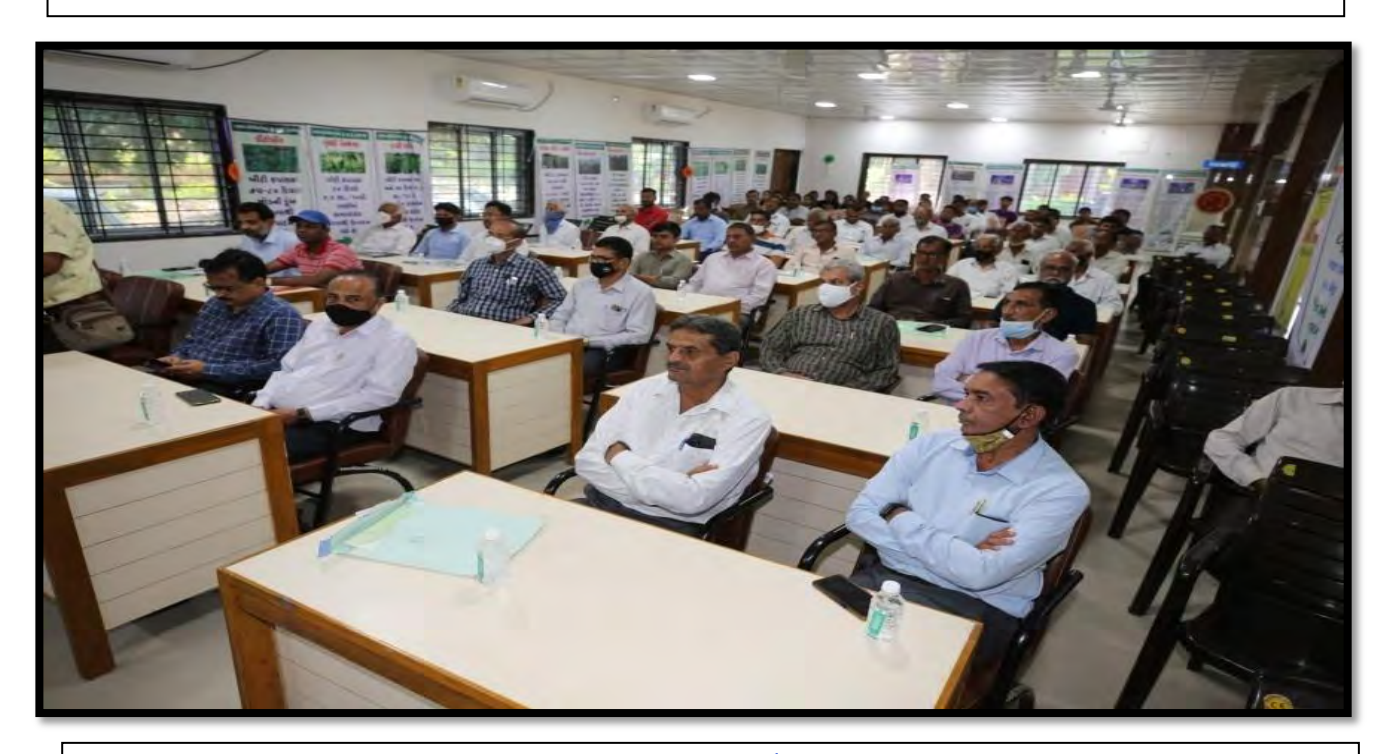
Farmers' Training programme organised on 7<sup>th</sup> October World Cotton Day, 2021 at CRS, JAU, Junagadh