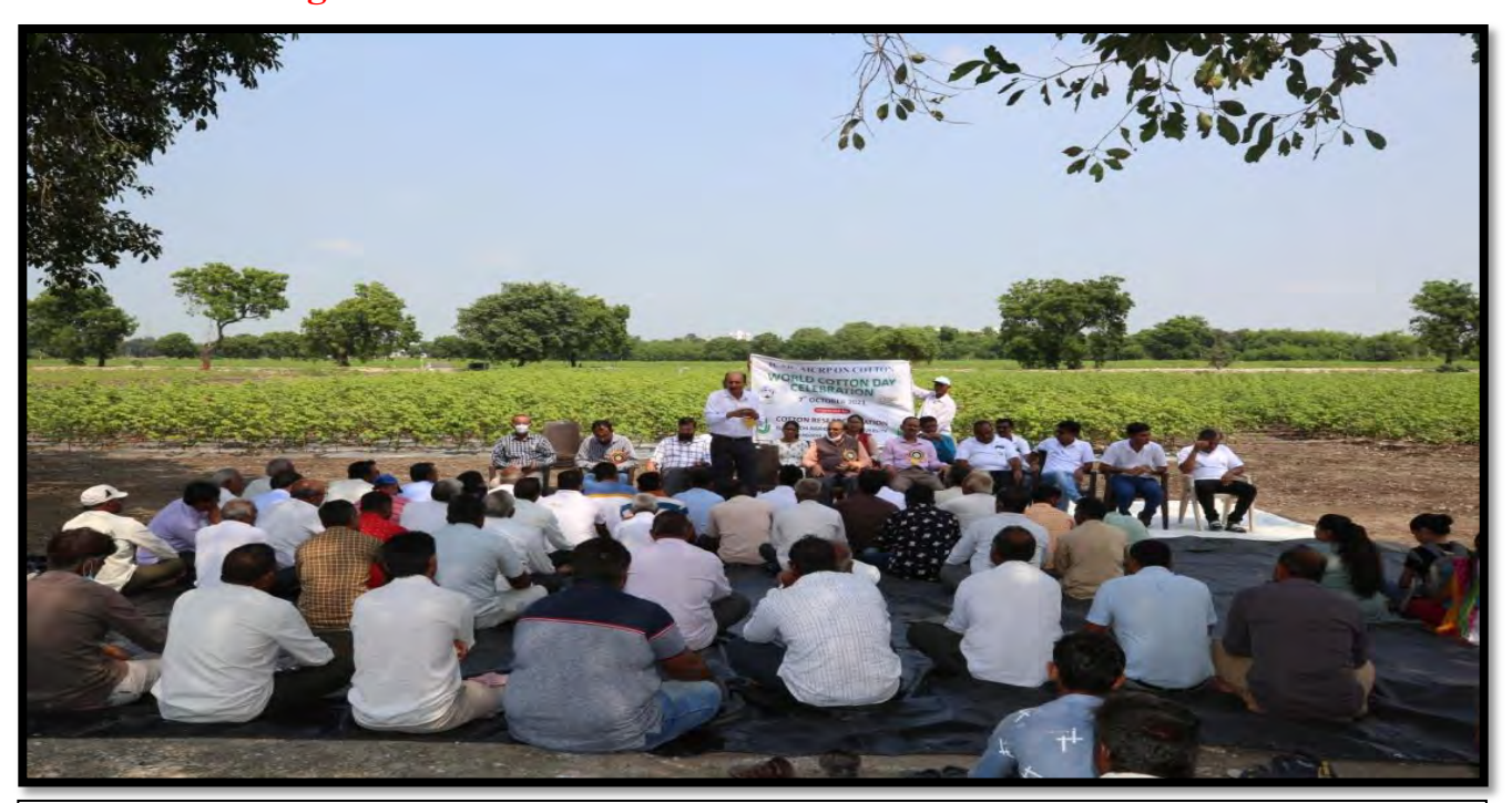
Celebrating World Cotton Day on 7<sup>th</sup> October, 2021 at CRS farm and a lecture was delivered on the importance of world cotton day.